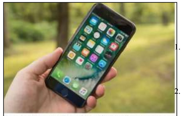
Giving through the GivePlus Mobile app is an easy and convenient way to donate to St. Mark's. It only takes a moment to set up an account: