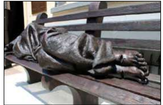
"Homeless Jesus" by Timothy Schmalz

The sculpture of "Homeless Jesus," created by Canadian sculptor Timothy Schmalz, depicts a man wrapped in a blanket with only his bare feet exposed. There is a hole in each foot, leaving the viewer with the impression that it is Jesus under the blanket.