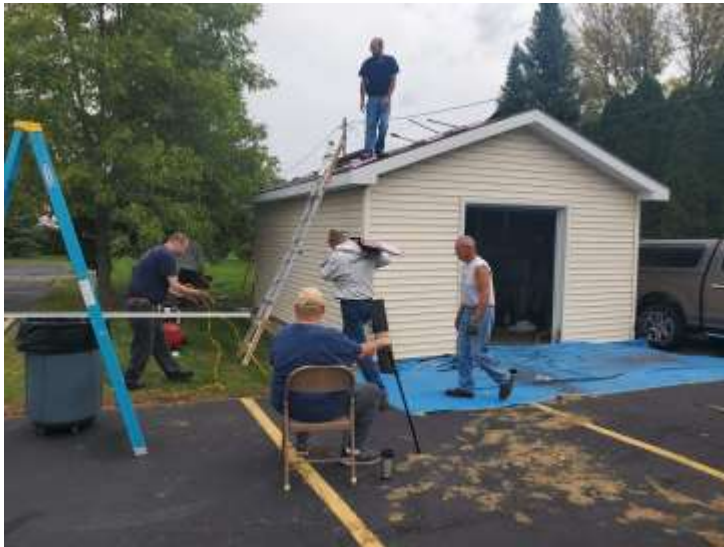
Our roofing crew hard at work!