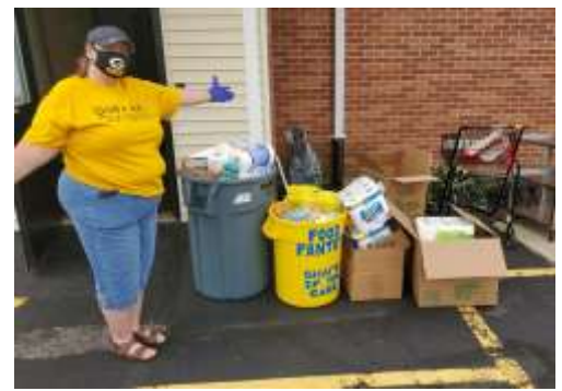
Our pantry shelves are looking good thanks to your contributions!

This past week, our storage building got a much needed new roof, thanks to our property committee and the many volunteers who showed up to help out. Thank you all!