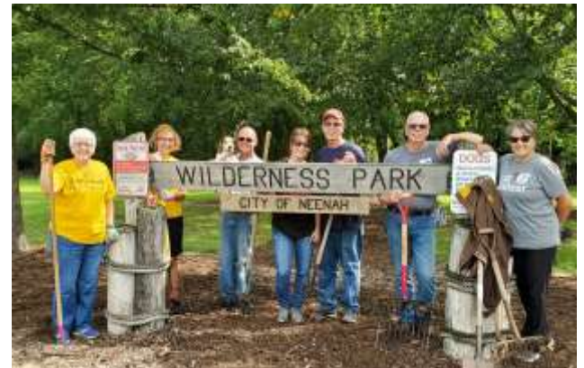
Our mulch crew after their labors.