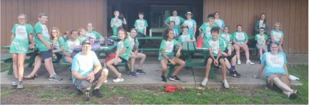
Here are the confirmands, along with some of the leaders and volunteer helpers.

On June 9th and 10th, confirmands from St. Mark's, St. Paul's, and Gloria Dei Lutheran Churches in Neenah gathered for a retreat at Memorial Park. It was hot, but everyone had a great time and enjoyed the activities and lessons that the pastors from each church (along with a few adult volunteers) prepared for them.