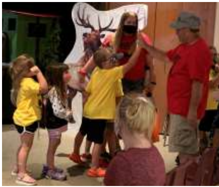
The kids “high-5” one of the leaders.

The kids learned that Jesus’ Power Pulls You Through Life. They had fun singing songs with actions, learning about trusting in Jesus, and laughing.