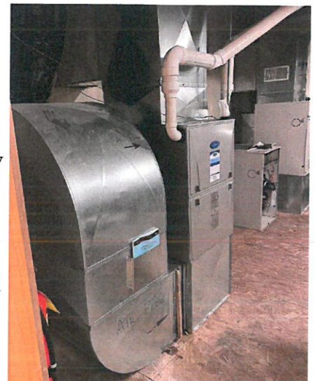
Here's our new furnace in case you don't want to climb up into the attic to see it!