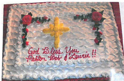
Here is the beautiful cake for dessert!